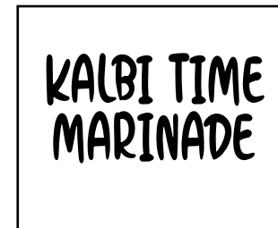
LOGO ADJUSTMENTS Don't stretch or distort logo.