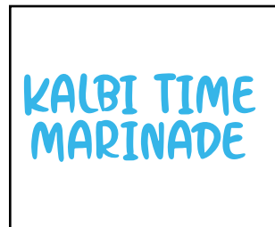
COLOR/TYPE CHANGES Don't use other colors or fonts.