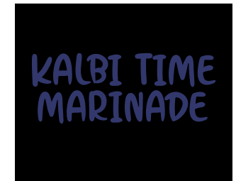
LOGO PLACEMENT Don't place logo on busy backgrounds. This includes placing dark logo versions onto a dark background.