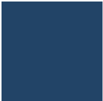
C94 M75 Y36 K23 L 28 A -3 B -25 R34 G68 B103 #224467